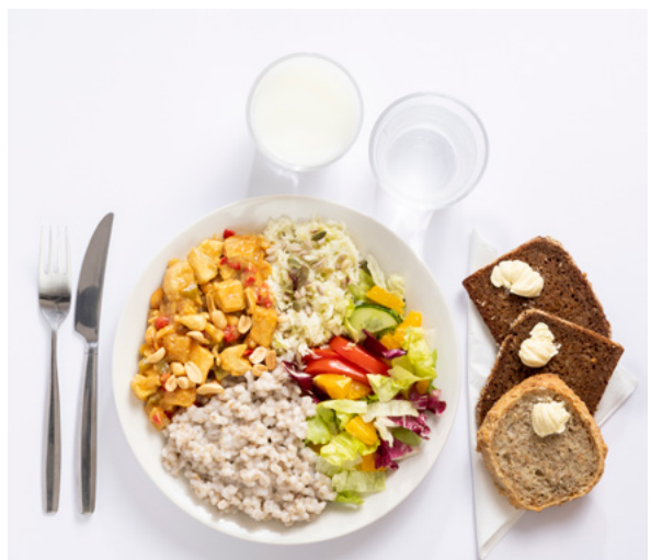
1000 kcal (4,2 MJ)