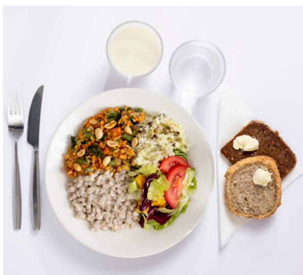
700–800 kcal (2,9–3,3 MJ)