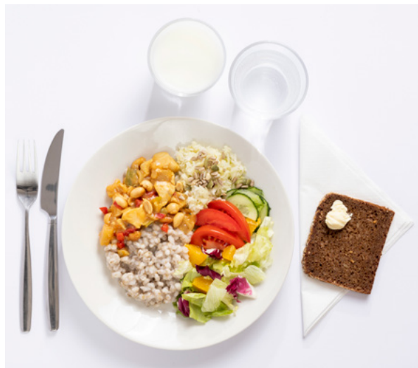
500 kcal (2,1 MJ)

A model meal of which 1/4 contains broiler-vegetable curry, 1/4 a barley side dish and 1/2 various vegetables: Oil-marinated white cabbage salad topped with seeds, and greed salad, tomato, cucumber and bell peppers. A glass of milk and water and a slice of rye bread topped with vegetable fat spread.