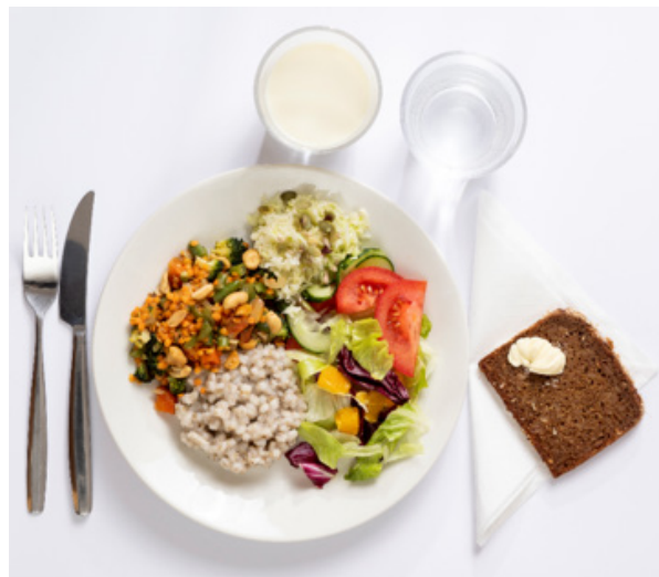
500 kcal (2,1 MJ)

A model meal of which 1/3 contains a lentil-bean curry, 1/3 a barley side dish and 1/3 various vegetables: Oil-marinated white cabbage salad topped with seeds, and greed salad, tomato, cucumber and bell peppers. A glass of oat drink and water and a slice of rye bread topped with vegetable fat spread.