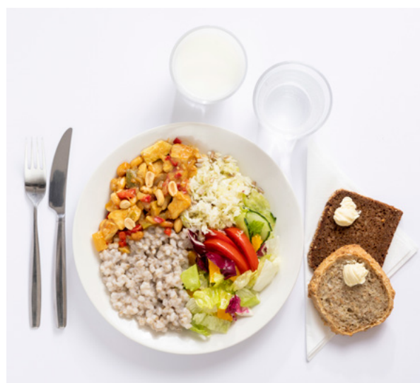
700–800 kcal (2,9–3,3 MJ)