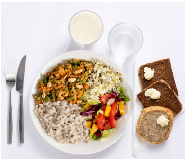
1000 kcal (4,2 MJ)